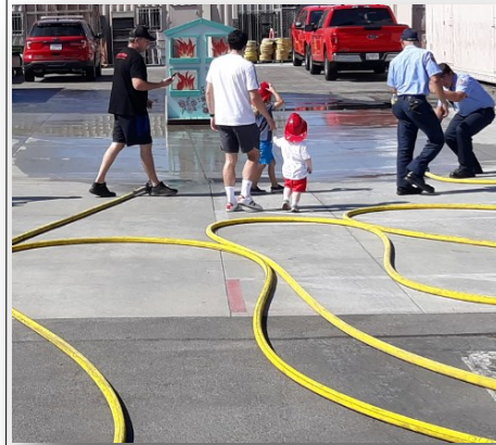
Kingman's human "Mom"

The CERT team taught the kids how to use a fire extinguisher using an electronic fire simulator. And the RACES group gave ham radio demonstrations.